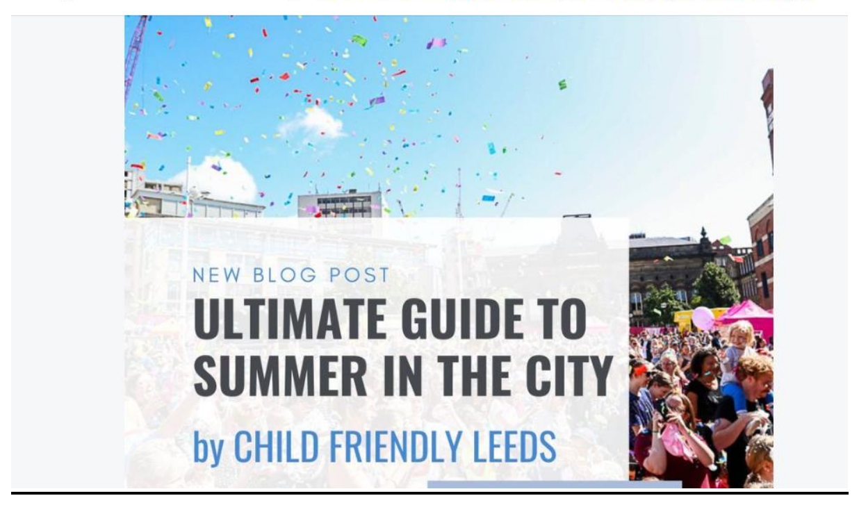
Image attached and link through: wearechildfriendlyleeds.com/2023/07/26/schoolholidays/

Summer is here, and it's time to make the most of the vibrant city! Whether you live local or just visiting Leeds, there are numerous exciting events happening both free and low-cost. Child Friendly Leeds have shared their ultimate guide to summer in Leeds here. From the fantastic Leeds Bear Hunt to arts, crafts, climbing and den building activities, there is something for everyone.